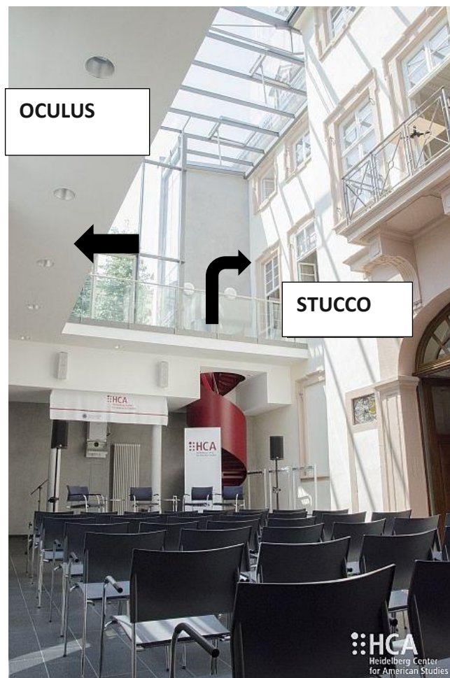
The Atrium (Main Auditorium)